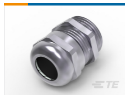
TE Part # T3609160122-000 DLX-16-M (5-10)