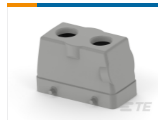
TE Part # T3609160202-000 DLX-16-LM