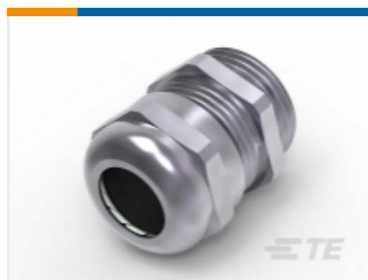
TE Part # T3609160102-000 DLX-16-M (4-8)