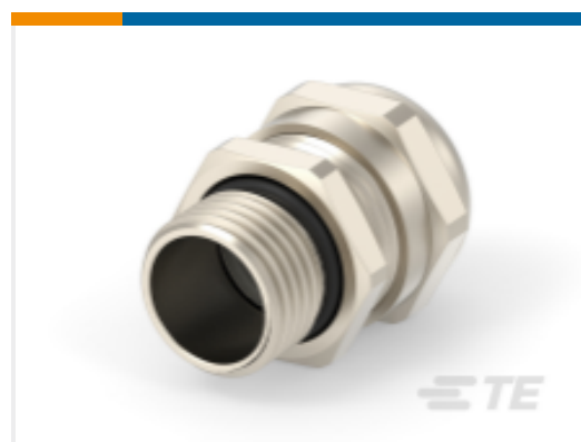
TE Part # T3609160222-000 DLX-16-LMB