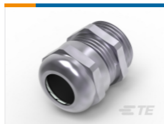
TE Part # T3609160112-000 DLX-16-MT (2-6)